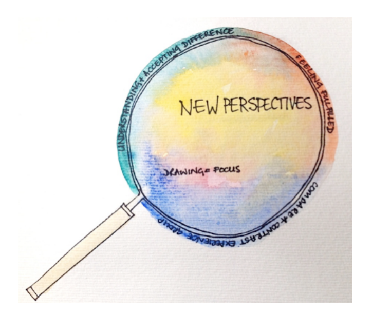
Figure 5 Thematic network 'new perspectives'

There were a number of comments in the four focus groups that related to seeing a situation from 'new perspectives', theme four, be that the Parkinson's condition, their outlook on life or a personal situation. The art-making in art therapy offers the opportunity for participants to use an alternative form of expression, a material medium which gives the issue a malleable physical form. In FG3, art therapy group member, Eduard makes a comparison between psychotherapy and art therapy, observing that psychotherapy can feel a little invasive sometimes. In contrast, in the following excerpt, Eduard constructs a possible reason for talking in art therapy feeling "more natural", given that the process of drawing makes you single out one aspect. This creates a starting point for the construction of a personal narrative; the action of making organises and helps the person reflect before putting experience into words.