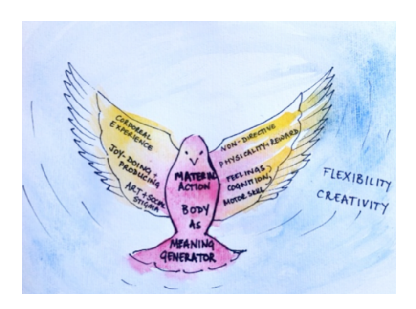
Figure 3 Thematic network 'material action'