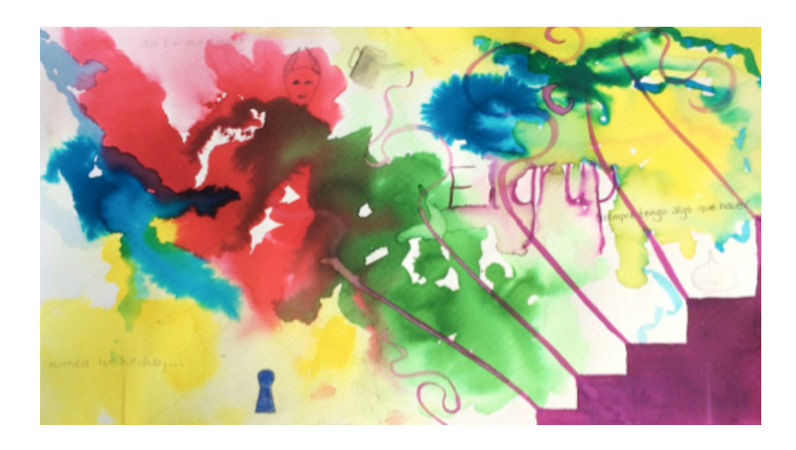
Figure 8 Researcher creative response to FG3

The material I chose was watercolour ink, which I had fun applying because it is quite unruly and very vibrant. This is coherent with my experience of conducting this particular focus group. Looking at the image I still see the intensity of my personal experience: of my worrying about their physical vulnerability; worrying about the discussion topic (and perhaps even art therapy itself) being a triviality in comparison to their difficult life situations; a contrasting strength and vibrancy that developed in the jovial group interaction. Palpable feelings of passion, rage, vulnerability and masculine sexuality were all on the cusp of breaking through the harsh reality of the progression of Parkinson's, some members being markedly more affected by the condition than when they last saw each other.