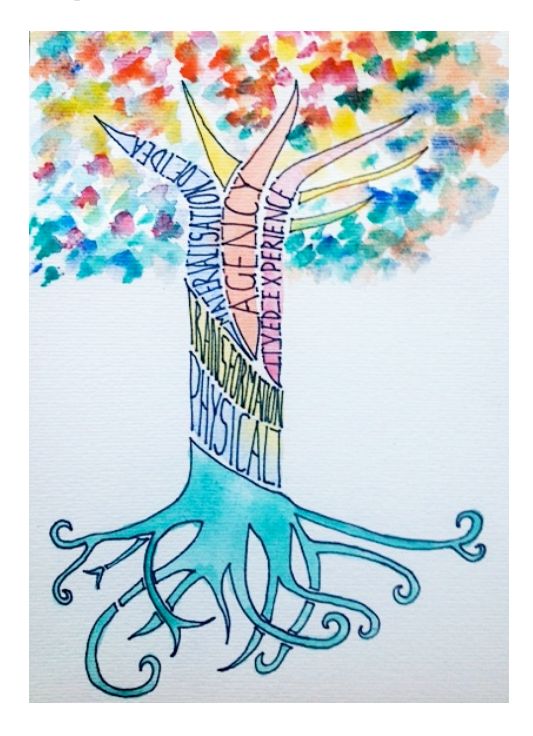
Figure 7 Thematic network 'physical transformation - as a relational aesthetic experience'

The final theme 'physical transformation' describes the aesthetic experience of creating an artwork in a group in an art therapeutic setting. The artwork becomes a meaning-generator which performs many functions. These include offering visual metaphors, holding the projection of difficult emotions and triggering personal memories. Creating holds the potential for taking an idea and giving it a tangible form. The materialisation of this idea is a transformation and the result is external, concrete and more often than not quite different from the original idea, heavily