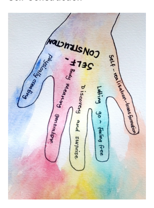
Figure 2 Thematic network 'self-construction'

The theme 'self-construction' (see Figure 2) alludes to a metaphorical rebuilding of the self, the person's sense of who they are, facilitated by their hands-on experience of physically creating and reflecting on the artwork, offering the possibility of increasing self-awareness and (re)discovering parts of themselves in a playful and satisfying way. This first theme also highlights the potential for self-transformation through the externalisation of issues and active engagement of physical manipulation allowing the person to challenge internalised beliefs.