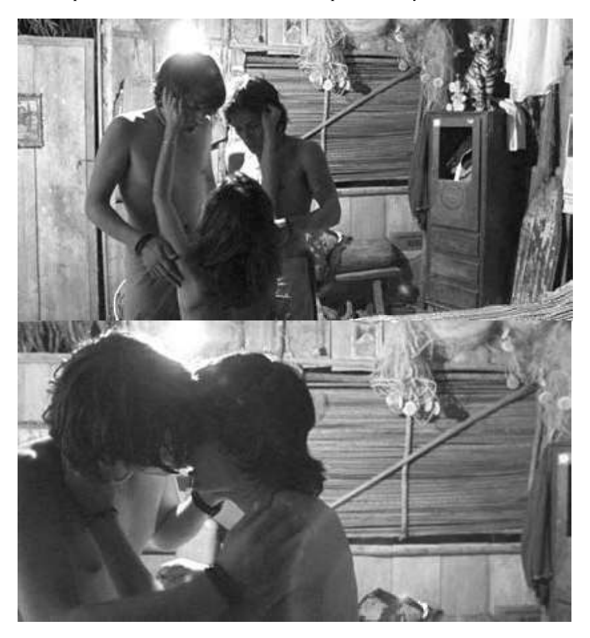
Figure 2. The threesome at the end of Y tu mamá también (Alfonso Cuarón, 2001).

Tenoch; by bringing to the surface their fantasy, as well as the homosexual core of their friendship, she returns the excess of the real to its place in the symbolic.